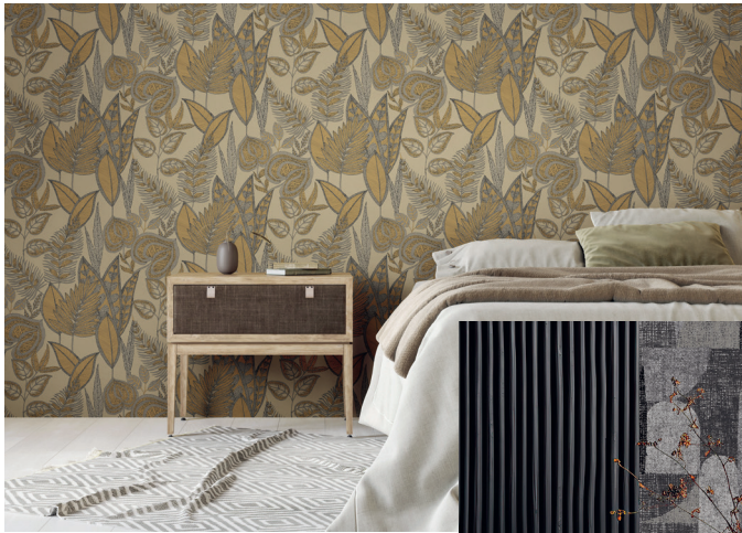
Leaf structures, partly playful, partly abstract. Brings a canopy of leaves to your wall. (Design „Pianta“ from the collection „Tesoro“)