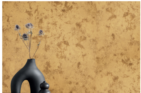
Amorphous, marble-like structures, decorated with real glass beads and mica. Versatile in use. (Design „Perlina“ from the collection „Tesoro“)