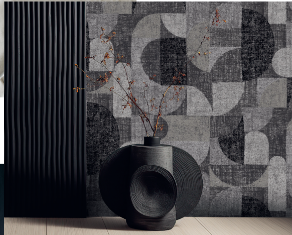
Graphic elements with a net-like structure that connects the shapes. (Design „Forma“ from the collection „Tesoro“)